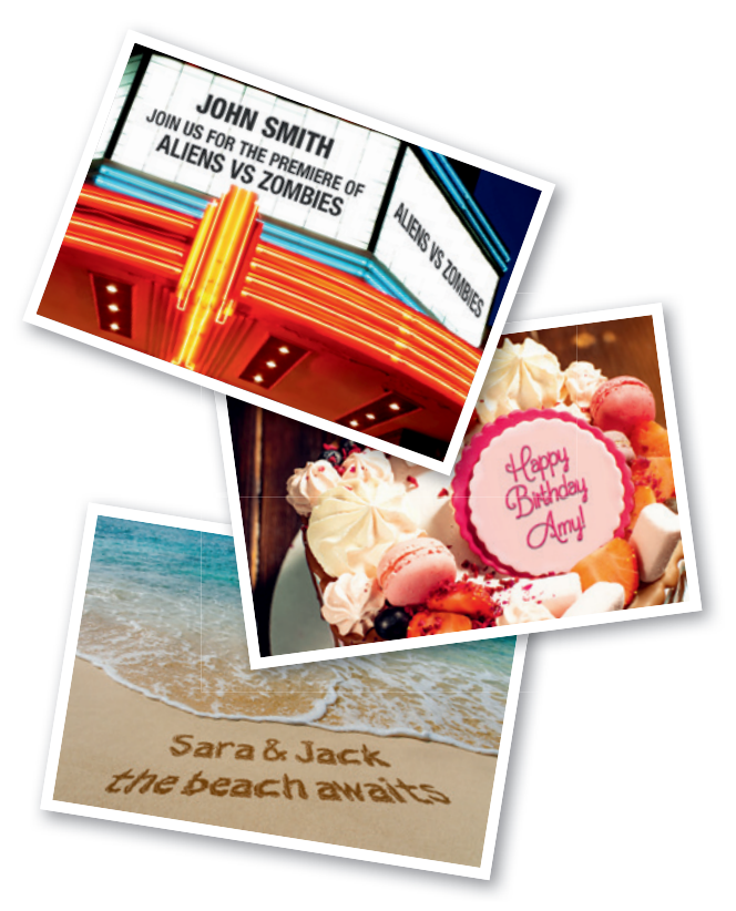
EFI is now offering two compatible options for variable data processing software: FusionPro<sup>°</sup> and EFI VDP templates powered by MarketDirect.