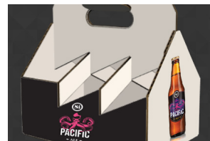
6 Bottle Carry All

Your clients can then add artwork to the box template from their own asset library, or select from a preset asset you've assigned. Artwork can be moved, tiled or modified as required to fit the template. Your customers can also select different substrates and finishing options.